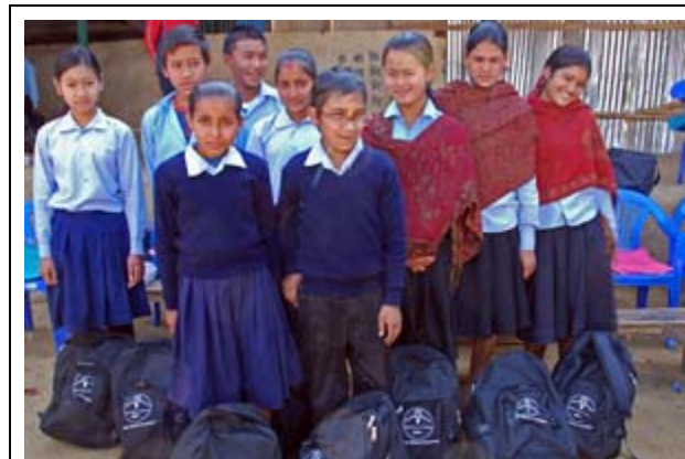
These are all the scholarship recipients in the village of Bahundanda, which is located on a mountaintop in the Himalayas.